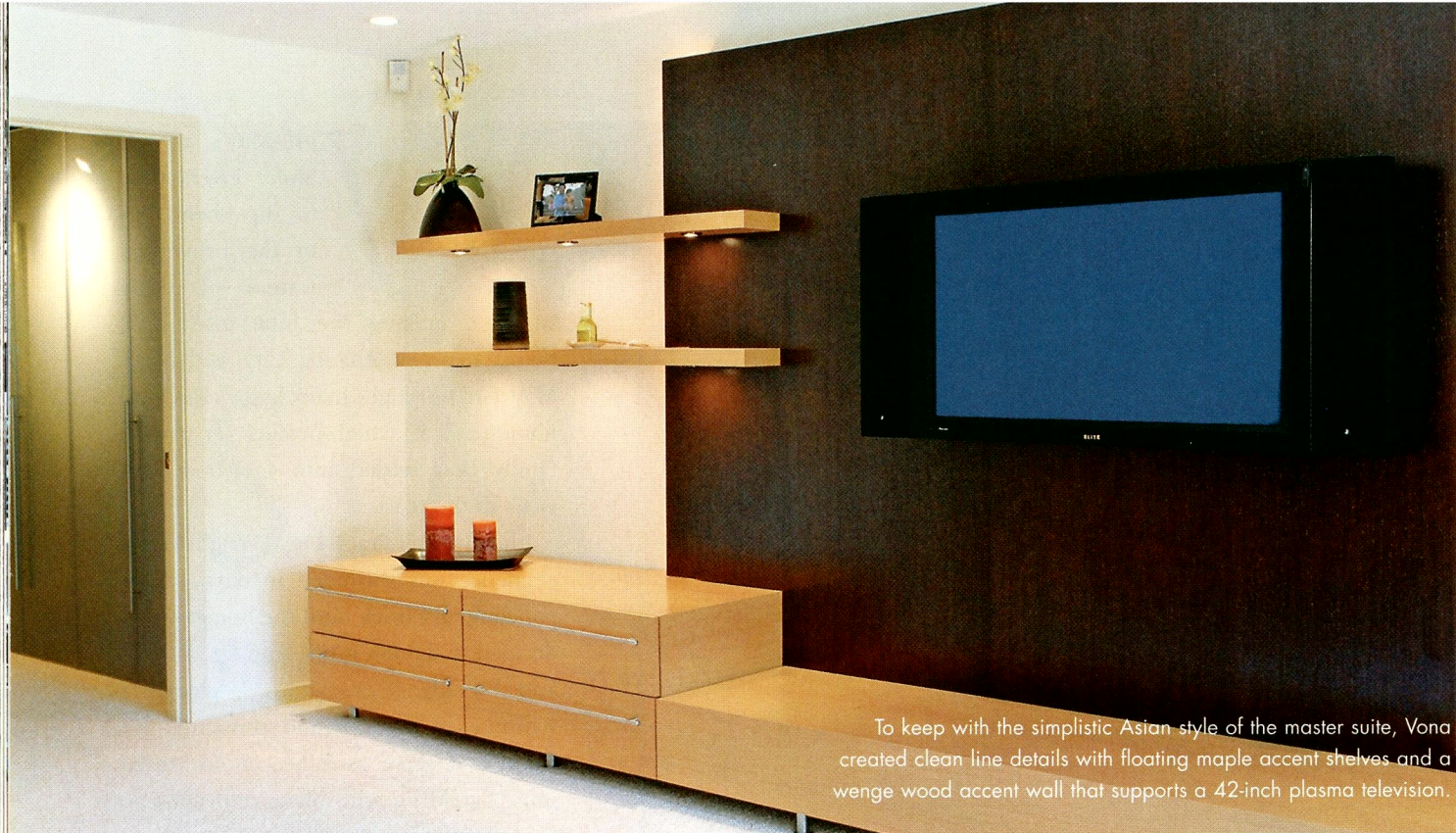
To keep with the simplistic Asian style of the master suite, Vona created clean line details with floating maple accent shelves and a wenge wood accent wall that supports a 42-inch plasma television.