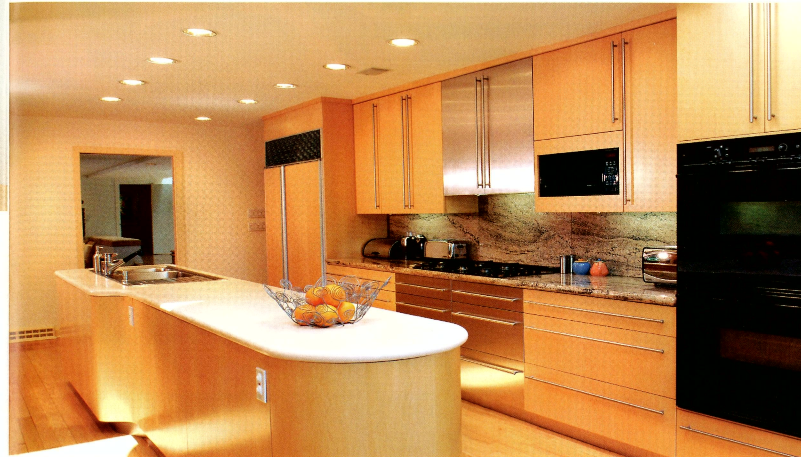
TOP RIGHT The light maple cabinetry carries over from the bedroom to the kitchen. A customized elongated counter creates buffet-style dining options for family events. The island separates the two preparation areas of the kitchen, one housing appliances and the other providing additional counter space.

A 50-inch plasma television hangs above a black Absolute granite fireplace, and to keep the room clean and cord-free, all electronics are wired into one access area custom-made by Carmana Designs, Ltd. They work in conjunction with each other in various ways. For example, when you turn on the television, the lights automatically dim.