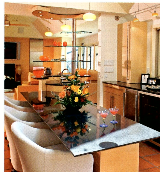
BOTTOM The dramatic Black Absolute granite of the island is echoed on the fireplace surround of the high-tech family room.

“The electronics that drive the system in the media room are housed behind the brushed stainless steel cabinet, and they can access the entire system with a Marantz smart remote,” says Phil Becker, who owns Overtures LLC in Ocean View, N.J. “We gave them state-of-the-art equipment that is very simple to use.”